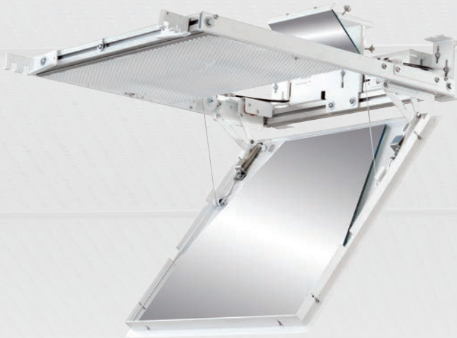
Ceiling mirror Pro