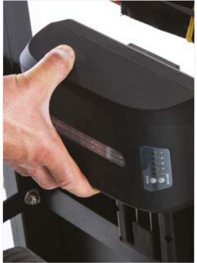
■ Removable and rechargeable 13 Ah-24V lithium battery