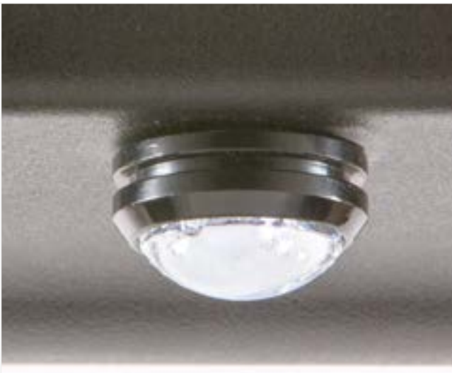
■ Curtesy light under control panel