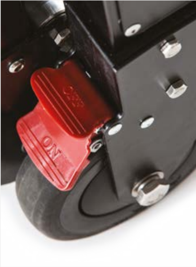
■ Braking wheels