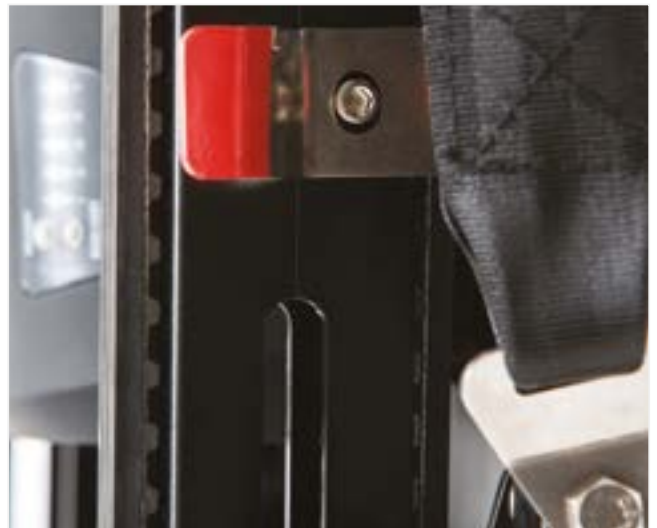
■ Track anchor unblocking system