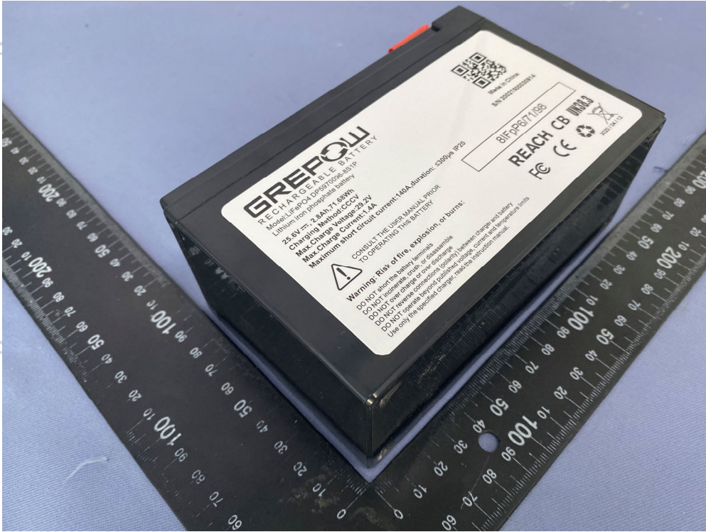
Figure 1 Overall view I of battery (外观图I)