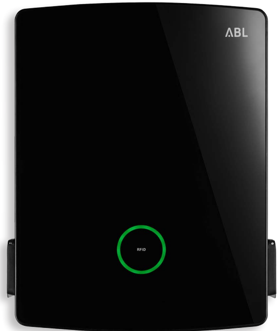
Product number 100000002

The robust design and high-quality workmanship of the Wallbox eM4 Twin protect it from external influences. The wallbox comes pre-installed and ready for connection thanks to the integrated Type A RCCB and DC residual current detection. All ABL wallboxes are made in Germany and comply with the highest safety standards.